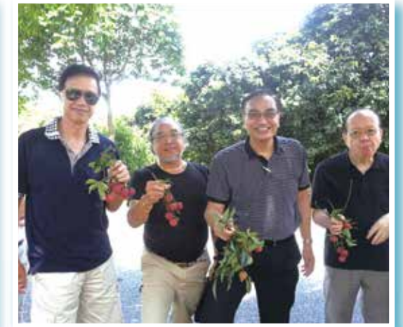
Tour of Lychee Farms during the harvest season in Panyu and Nansha in Guangdong, July 2013.