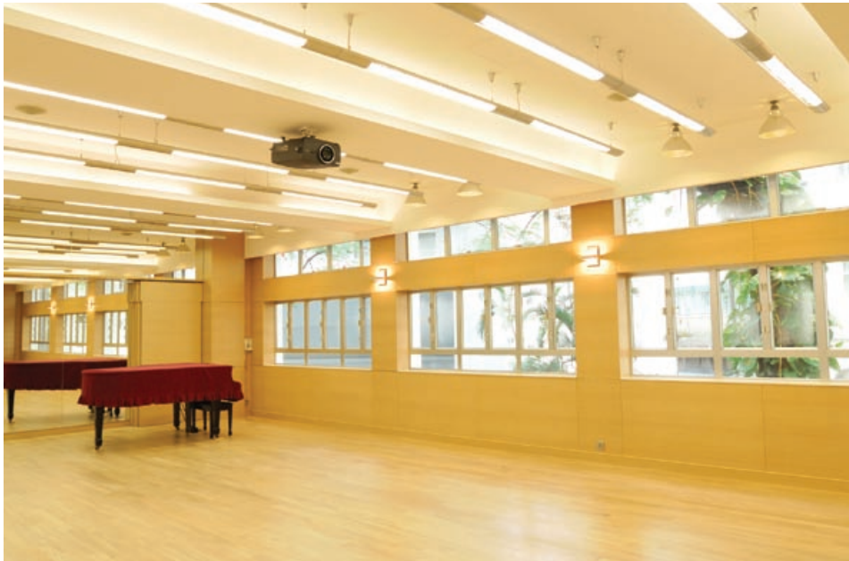
Yes, you have guessed it right! We can enjoy dancing and drama on the whole first floor, the Rehearsal Room.