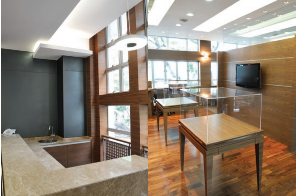
A pantry is located at the corner of the Second Floor.